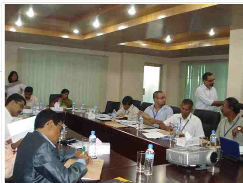
A compilation of resource material including session plans and training materials were provided to all participants