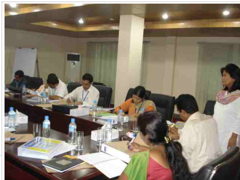
About 13 nominated members from the four Partner institutions took part.

The preparation of the manual was the biggest take away from the training. Working in groups, and assimilating the concepts emphasised on each day, groups of three worked on one aspect of the manual each. By the end of the programme, through presentations to the whole group at large, the manual and its contents were finalised.