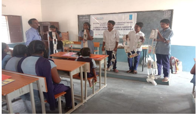
School students participating in a game to depict the importance of being transparent and honest in their efforts in achieving success.