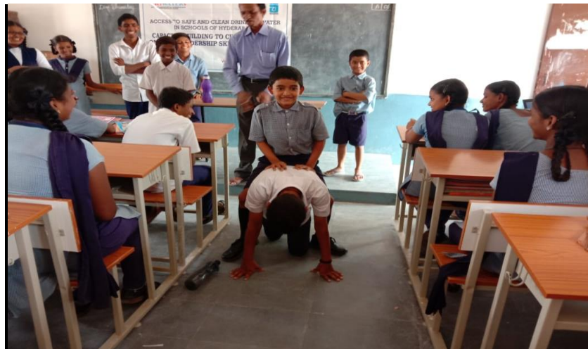
Students made to participate in a game during the Capacity Building Programme to depict the importance of taking RISK in achieving success.